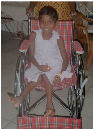
The girl with spina bifida from Jaffna

We met a six year old girl who had travelled from Jaffna down the recently reopened highway. She had severe spina bifida and her mother had been waiting six years for paediatric help. We were able to give her a wheelchair and her mother was so excited she ran up and down the ward pushing her daughter. We also gave two wheelchairs to the rheumatology wards, one to a boy with severe scoliosis who has lost the power in his legs and the other to a girl with juvenile arthritis.