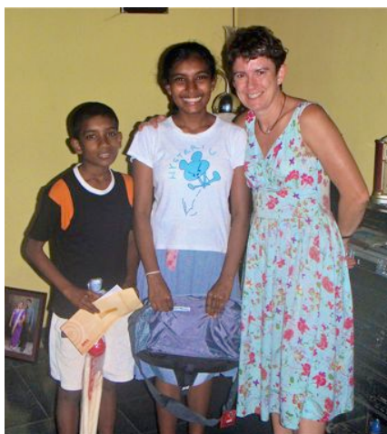
Shoe voucher and bat School backpack and stationary