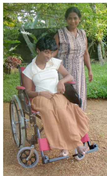
A very brave but disappointed man who we can hopefully help. A quadriplegic 17 year old

If anyone is interested in joining us for a visit to Sri Lanka, please make contact – no special skills are needed, just enthusiasm and money to pay your way!