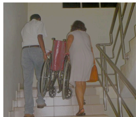
Delivery to Karanwanella