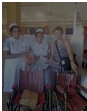
Wheelchairs for the ward