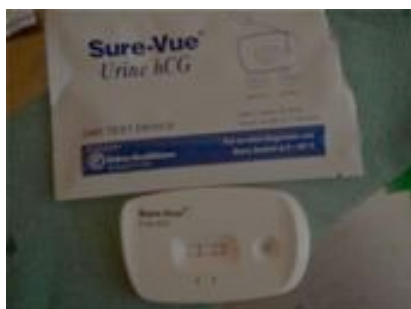
A positive pregnancy test

Many patients from previous clinics returned with their prescriptions from last year. We managed to confirm that one abdominal mass was an unsuspected pregnancy in a woman due to leave for Saudi Arabia to work. She had been given the Depo injection but obviously too late. Corallee Morrow had given us a box of pregnancy tests, which we fortunately had not yet delivered to the maternity hospital so we could test on the spot.