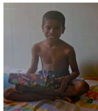
Presents for the children