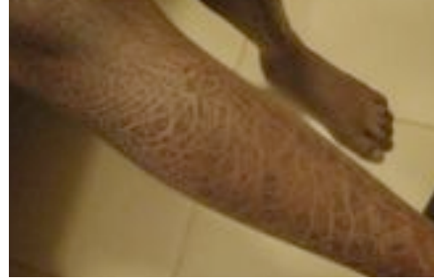
Severe dry skin and eczema