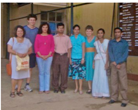
The team at Nawalapitiya Hospital