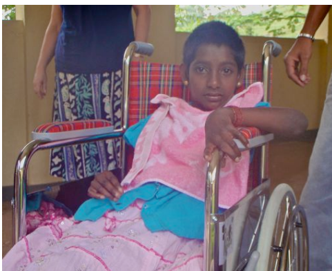
Girl with quadriplegia

The day after the clinics a truck arrived from Colombo with 20 wheelchairs donated by the Grade three children at Grimwade House, Melbourne Grammar School. We had three recipients at Samanala: a young girl with quadriplegic cerebral palsy, a child with Down Syndrome who had great difficulty walking any distance and an old man with bilateral club feet who found walking very painful.