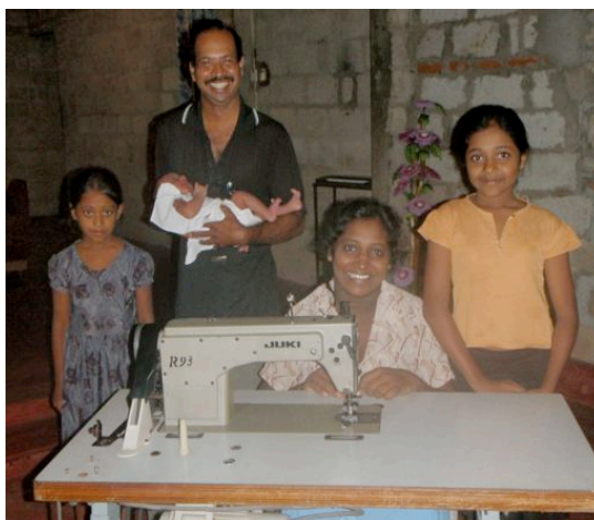
A secondhand industrial sewing machine