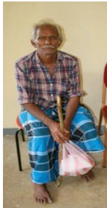
Patients at Samanala